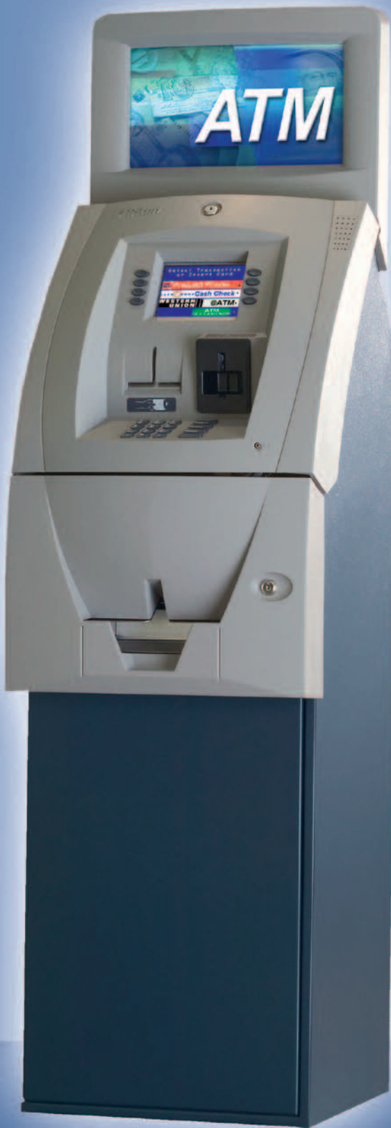
9100 in bayou bronze with backlit topper

The 9100 is our best selling ATM. This extremely popular machine was designed to be a low cost high-performance ATM. And it has proven to be perfectly suited for owners who need functionality and performance at a lower price point.