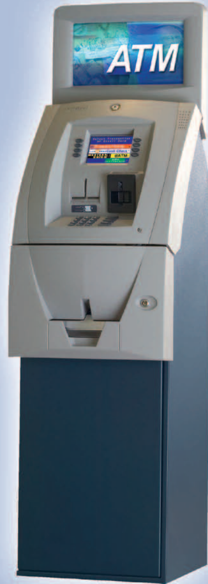
9100 in bayou bronze with backlit topper